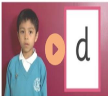
Phase 2 sounds taught in Reception Autumn 1

https://www.littlewandlelettersandsounds.org.uk/resources/for-parents/