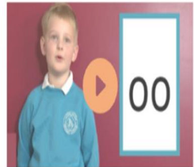
Phase 3 sounds taught in Reception Spring 1