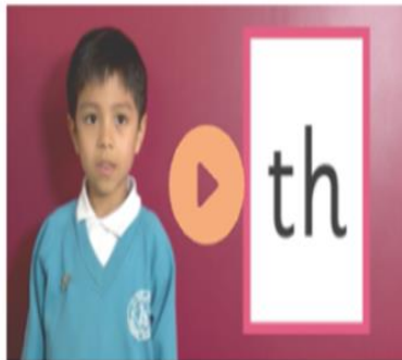
Phase 2 sounds taught in Reception Autumn 2